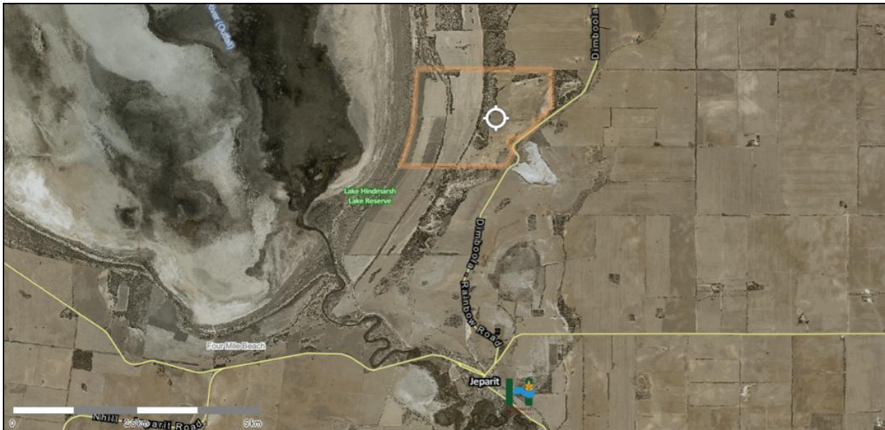
Figure 1: Subject site in relation to Lake Hindmarsh and Jeparit