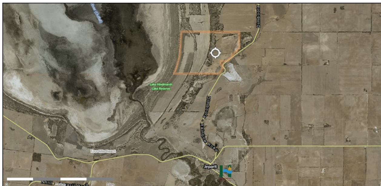
Figure 1: Subject site in relation to Lake Hindmarsh and Jeparit