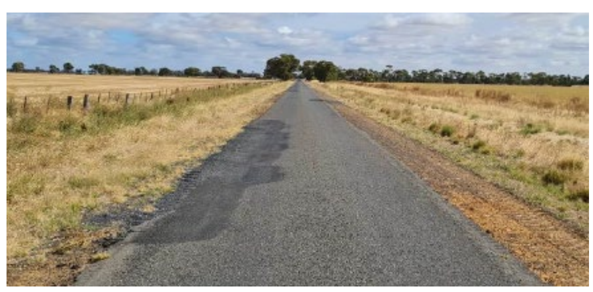
Figure 4.0 – Typical condition of Lorquon Road following damage in 2022

Officers have investigated new funding options to rectify these issues. The Australian Government has implemented the SLRIP that is currently open for applications, accepting project proposals of up to $5,000,000, with a maximum 80% federal government contribution. The project delivery timeframe is within 36 months of the funding offer being sent.