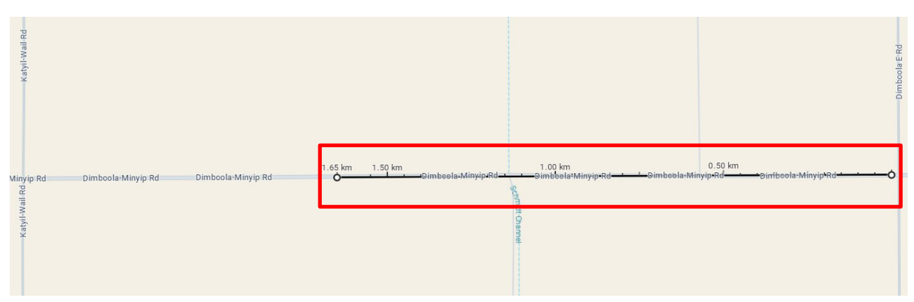
Figure 1.0 – Dimboola-Minyip Road works extent (approx.).

Site inspections show at least 1.65km on Dimboola-Minyip Road and 2.8km of Lorquon-Netherby and Lorquon Roads remain in poor condition and will require budget for full reconstruction and upgrade. All three roads are identified as critical agricultural routes in Hindmarsh, with Dimboola-Minyip Road also heavily utilised by traffic heading to and from the east of Victoria.