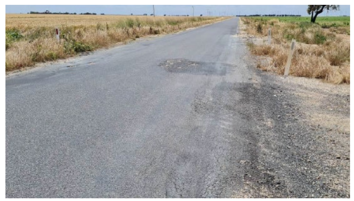
Figure 2.0 – Typical condition of Dimboola-Minyip Road taken following damage in 2022.