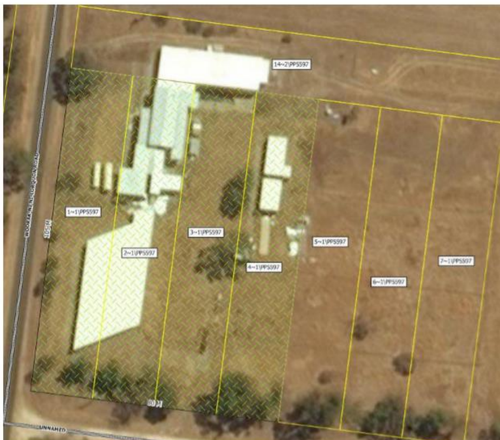
Map 2: Permit Area

The northern end of one of the existing buildings sits on the crown land reserve, as does the main vehicle access to the site.