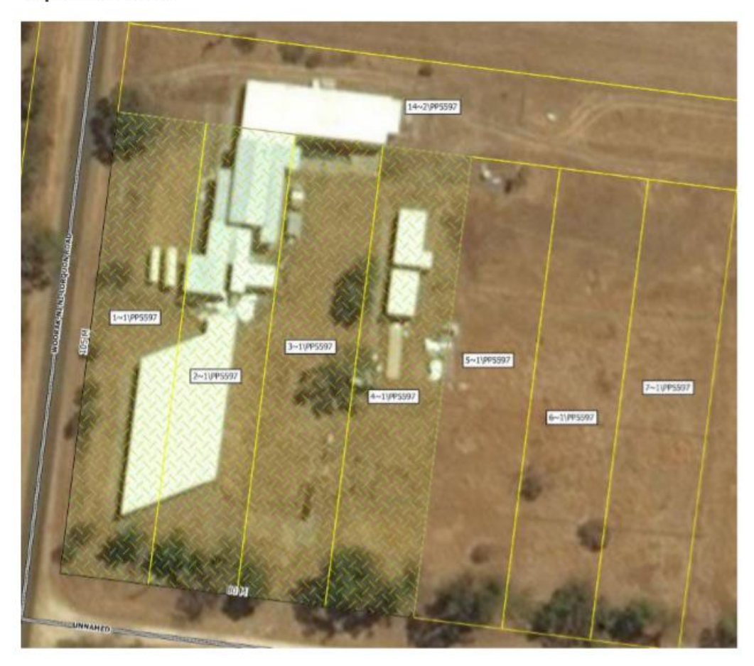
Map 2: Permit Area

Where that building is sited and the vehicle access should be part of any planning application, therefore Land Owner Consent from DELWP is required before the application process can proceed.