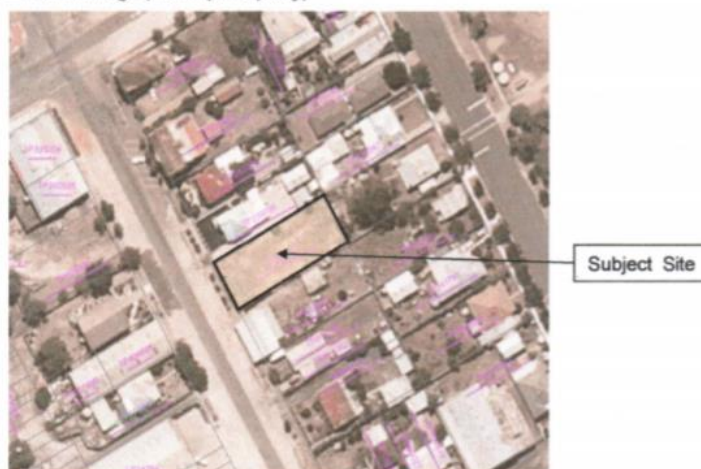
Figure 2 – Aerial Image (Vicmap Property)

An aerial image of the site and surrounds is displayed in Figure 2.