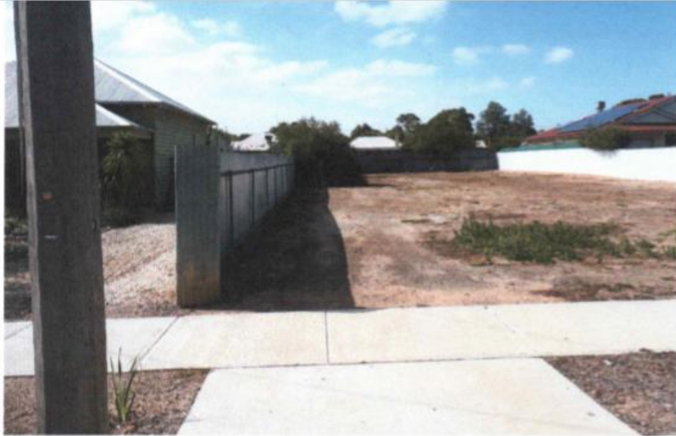
Location: Victoria Street, north west corner of property. Aspect: View to east along the northern boundary