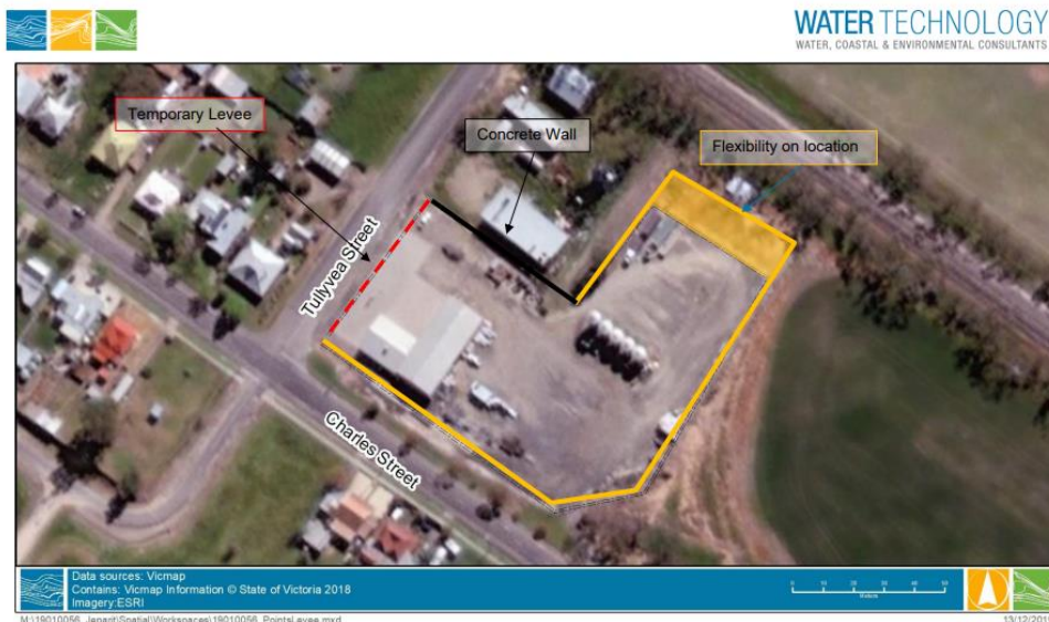
Figure 3-2 Plan of Site and Long Section Location