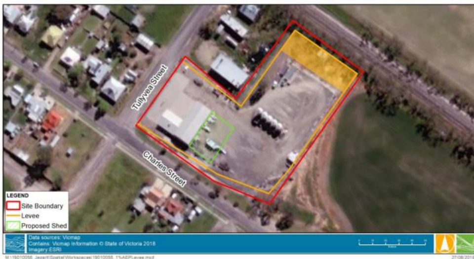
Figure 1-1 Site Layout

A detailed report has been submitted with the application as a Memorandum Report by Water Technology dated 21 March 2020 which details the flood risk and detailed design of the levee bank for the proposal. Refer to Attachment 2 – Memorandum Report by Water Technology. Two Figures from this report showing a site layout plan and a plan of the site and section are detailed below.