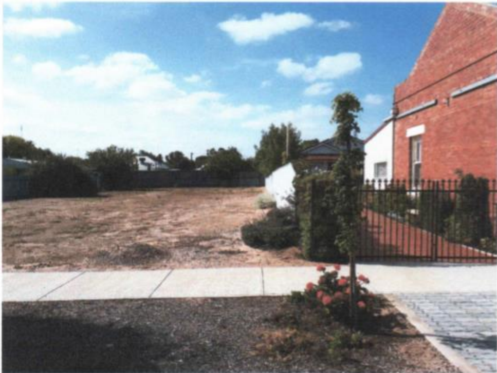
Location: Victoria Street, south west corner of property Aspect: View to east along the southern boundary.

Public Open Space has not been paid on the existing lot, however as the subdivision is for the purposes of two lots and each of the lots are unlikely to be further subdivided, the application is exempt from this requirement and no conditions will be applied to the permit.