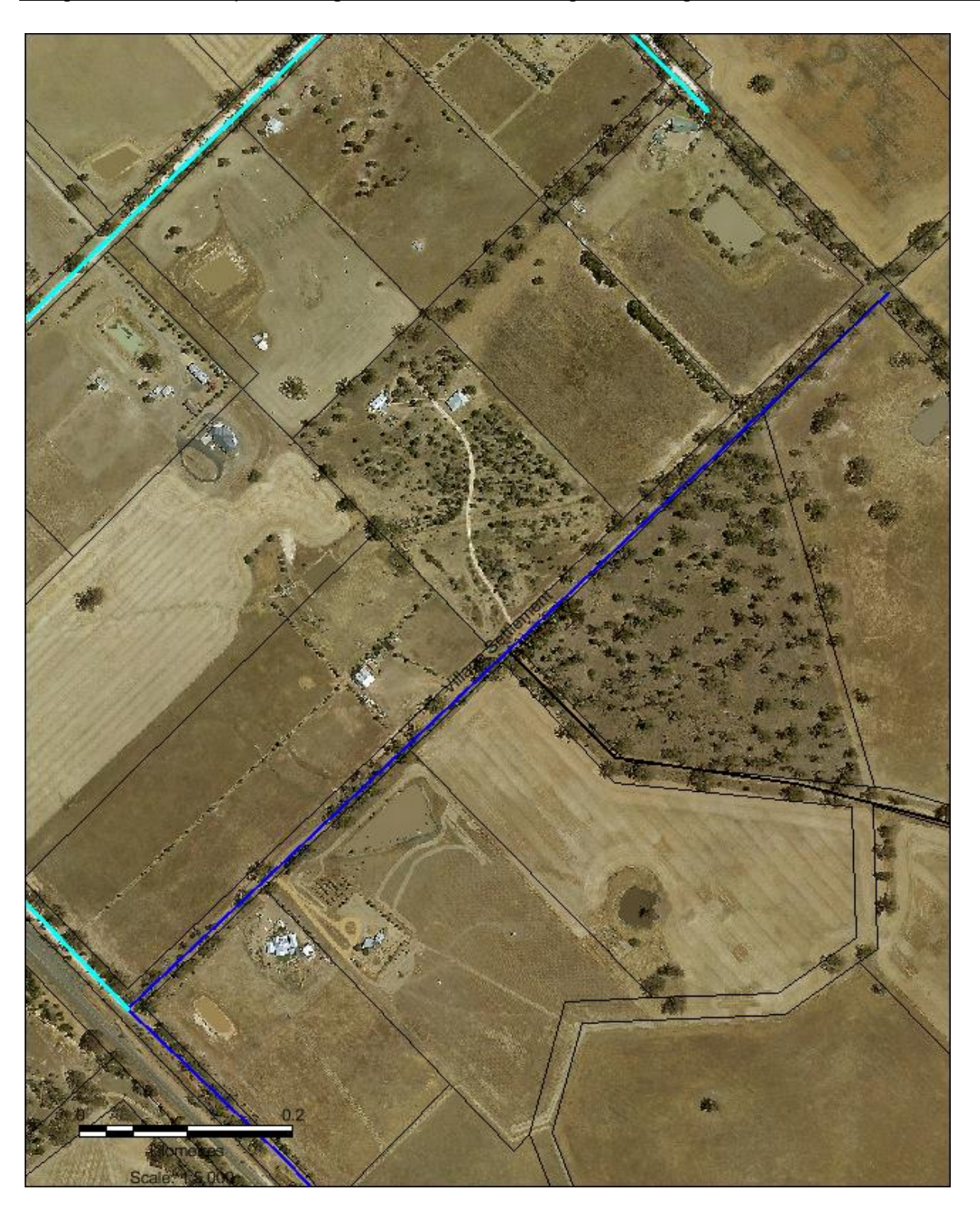
Image 1 - Aerial map showing location of 3 dwellings on Village Settlement School Road