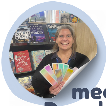
meet Danelle NHILL LIBRARY